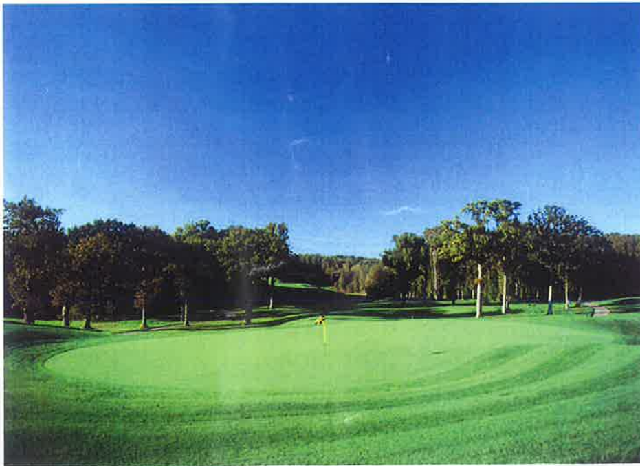
East Sussex National