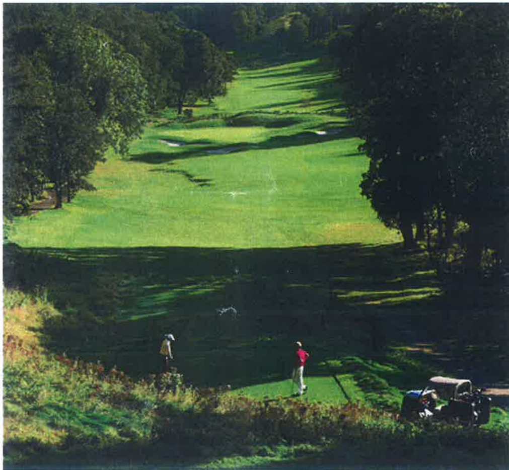
The Downs Course - Goodwood

This day is more than just about the golf; it should be a whole luxury experience. Similar in places to the East Sussex National, The Downs course at Goodwood is within the Goodwood House estate, the family house of Earl of March one of England’s oldest aristocratic families. Whilst this is not the highest ranked golf course you have played on (it is 54th) you have never played on anywhere more exclusive or established. The club house makes the East Sussex National and The London Club look like Spor 12 in Korsor.