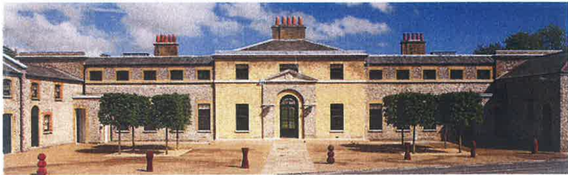
The Clubhouse - Goodwood