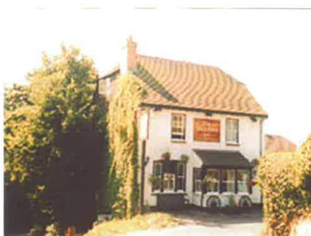
The Black Horse Inn

We are back in the Black Horse Inn, good food, good beer, good times